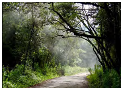
A road in the Brazilian rain forest.