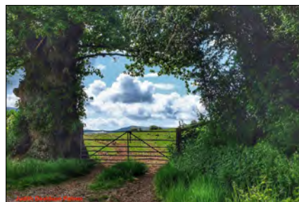
This image captures the beautiful, magical countryside just outside Hay-on-Wye, Wales. The wonderful old tree frames the fields beyond and the road less travelled. photo Judith Davidson-Palmer .