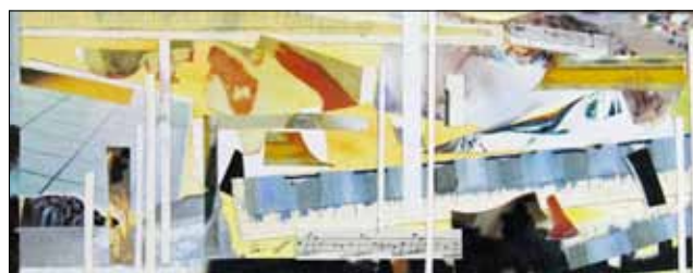
Summer Light , collage by Marvyne Jenoff