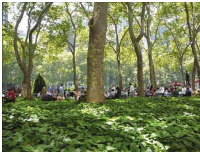
Summer, Bryant Park