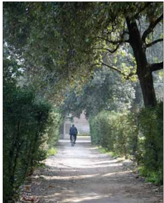
Parco San Sebastiano, Rome

Throughout this issue you will find artwork or photographs by Club members that conjure up our associations with summer. You can see others on the website.