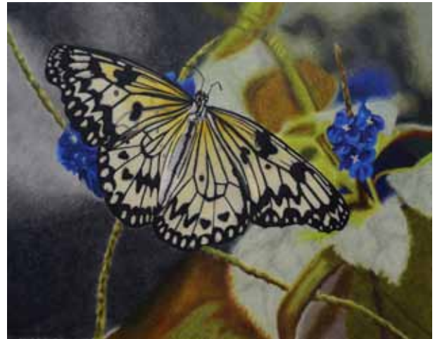
Black Lace, coloured pencil on drafting film, 8 x 10", by Cathy Pascoe

And, if you haven't yet uploaded your photo, this would be good time to do that as well!